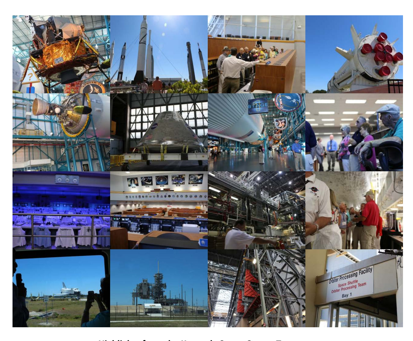
Highlights from the Kennedy Space Center Tour