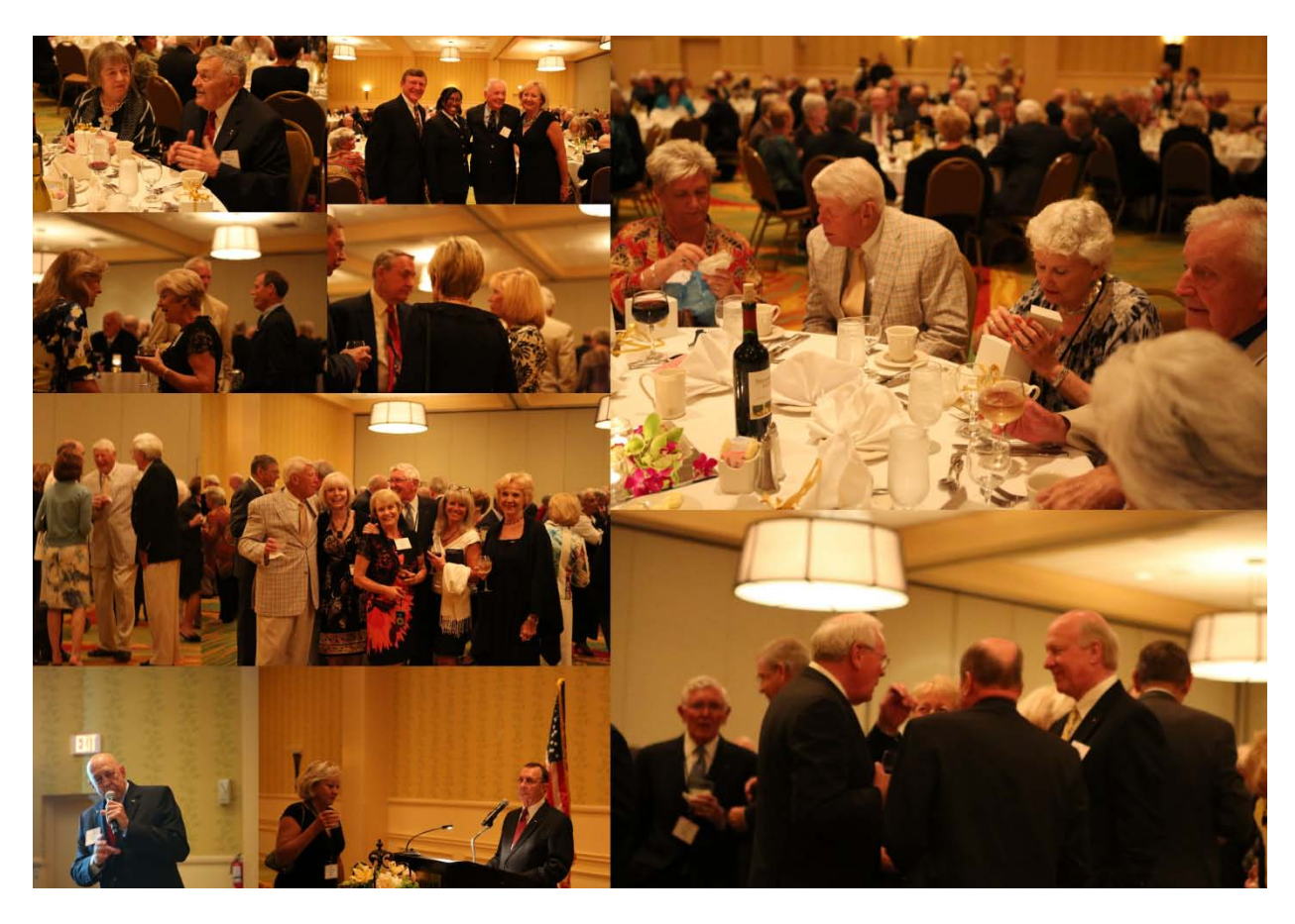
Golden Eagles and Guests during the 2012 Reception and Banquet