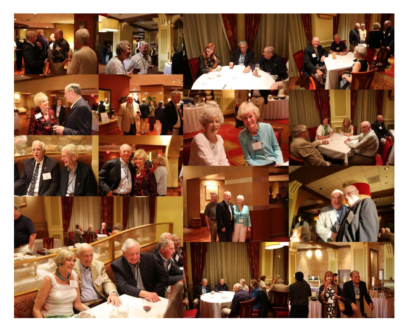
Golden Eagles and guests enjoy the 2012 Reunion Welcome Reception

The welcome aboard reception was held in the Lakeview Restaurant of the Wyndham Lake Buena Vista Resort. Approximately 240 Eagles and guests attended.