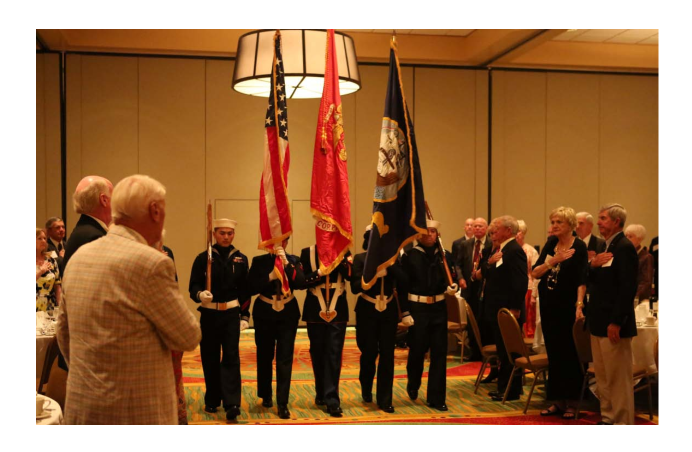
Presentation of the Colors to commence the Golden Eagles Reunion Banquet