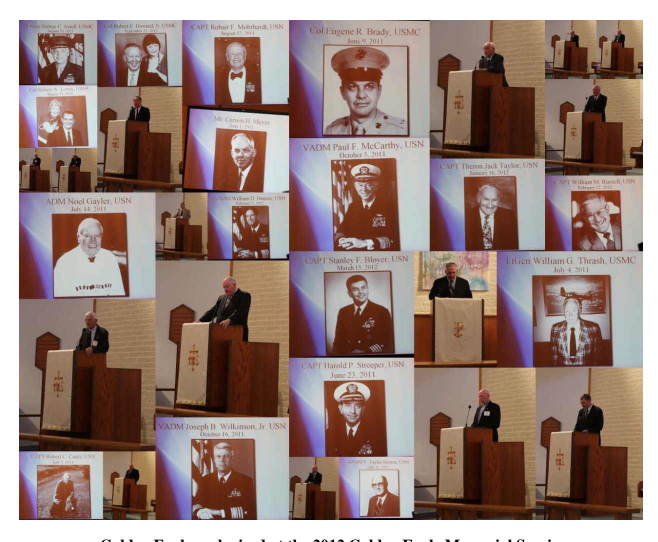
Golden Eagles eulogized at the 2012 Golden Eagle Memorial Service